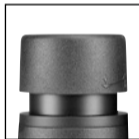
Position 2 With or without glasses