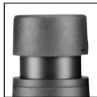
Position 3 'Up' without glasses